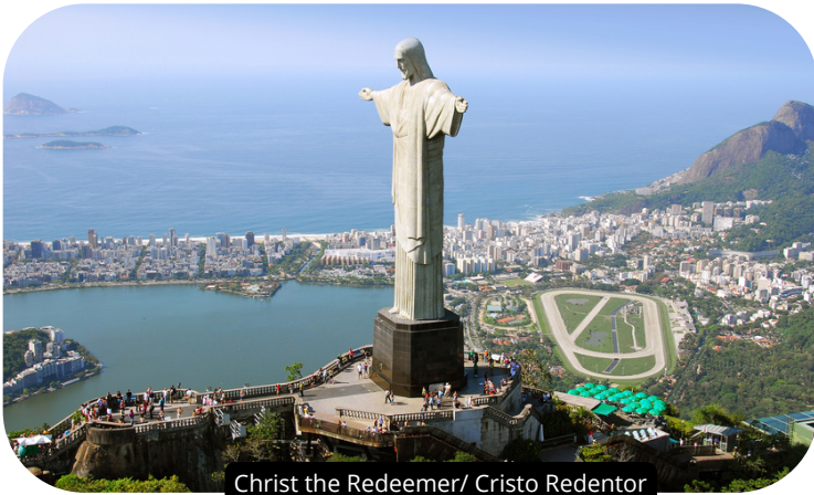
Christ the Redeemer/ Cristo Redentor