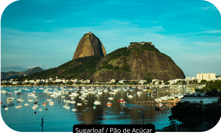
Sugarloaf / Pão de Açúcar