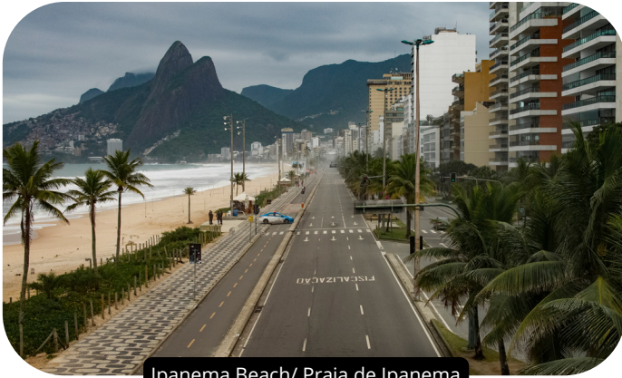
Ipanema Beach/ Praia de Ipanema