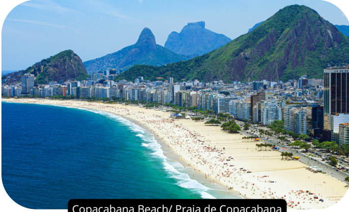
Copacabana Beach/ Praia de Copacabana