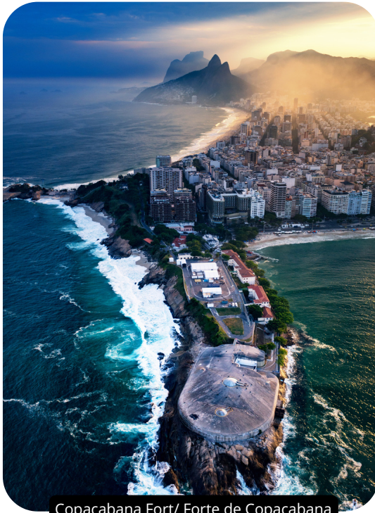
Copacabana Fort/ Forte de Copacabana