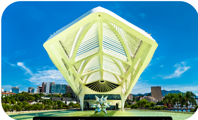
The Museum of Tomorrow/ Museu do Amanhã